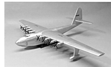
Howard Hughes' Flying Boat