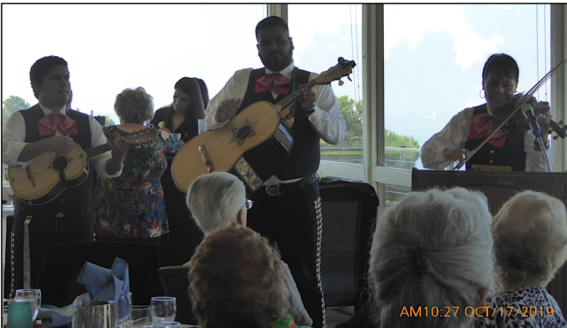
THE MARIACHI TESORO GROUP